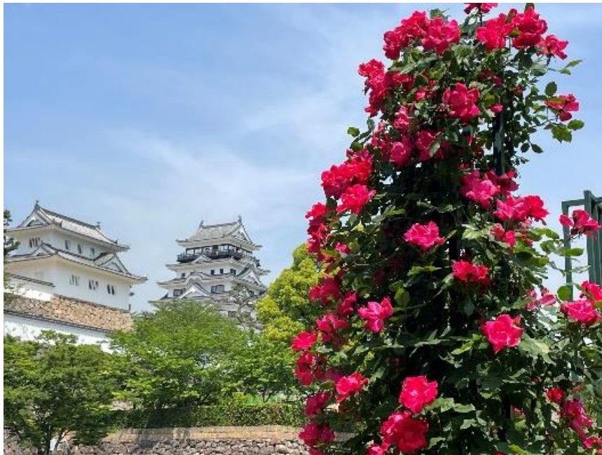
Fukuyama Castle (The city's landmark)